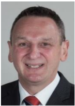
Chair, Economy & Culture Scrutiny Committee January 2022

We are fortunate in Cardiff to have an extremely efficient and professional Scrutiny Service that leads the way in how it supports scrutiny in Cardiff. I hope that future administrations recognise this fact and continue to provide Scrutiny with the support it needs in order to continue to deliver effective scrutiny.